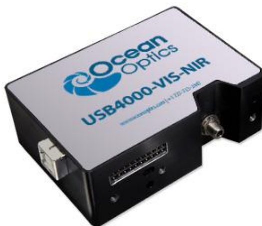
Figure 7. System specifications for the Ocean Optics USB 4000-VIS-NIR spectrometer (Dunedin, FL, USA).