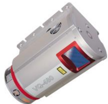
Figure 4. Operating specifications for the VQ-480 Airborne Scanning LiDAR manufactured by Riegl, Riedenburgstrasse, Austria.