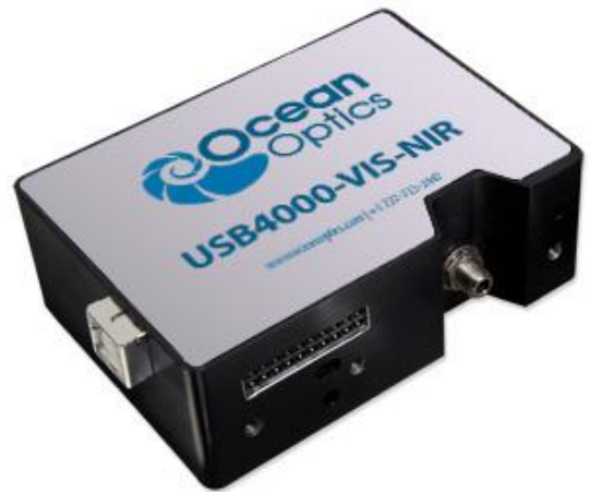
Figure 7. System specifications for the Ocean Optics USB 4000-VIS-NIR spectrometer (Dunedin, FL, USA).