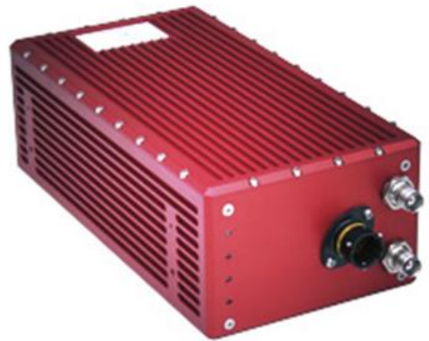
Figure 9. Specifications for the OXTS RT4041 GPS/INS subsystem manufactured by Oxford Technical Solutions, Oxfordshire, UK.