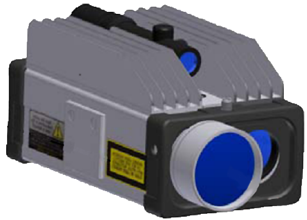
Figure 5. Operating specifications for the LD321-A40 laser distance meter manufactured by Riegl, Riedenburgstrasse, Austria.