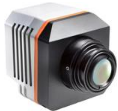
Figure 8. System specifications for the Gobi-384 LWIR thermal imaging camera manufactured by Xenics, Leuven, Belgium.