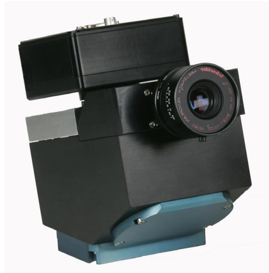
Figure 6. Operating specifications for the Hyperspec™ VNIR Concentric Imaging Spectrometer manufactured by Headwall Photonics, Fitchburg, MA. FOV = 2\arctan(d/2f) = 49.64 deg, where f=8 mm lens and d=7.4 mm.